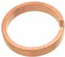
OD 70 x 12 mm, AH 60E8 Keyway 10 mm