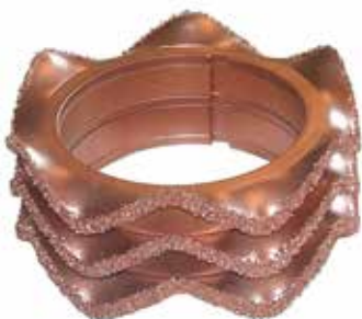
SW Ø 180 used together with 19 mm spacer