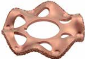
SW Ø 150 x 6 mm, AH 60F7 Keyway 10 mm