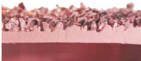
Copper Carbide Design