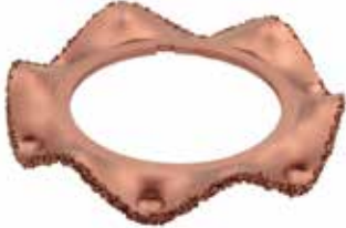
SW Ø 200 x 6 mm, AH 125F7 Keyway 10 mm