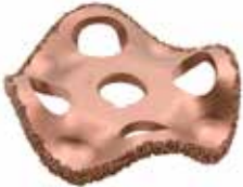
SW Ø 100 x 6 mm, AH 22F7 or 19F7 Keyway 6 mm