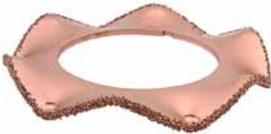
SW Ø 225 x 6 mm, AH 150F7 Keyway 10 mm