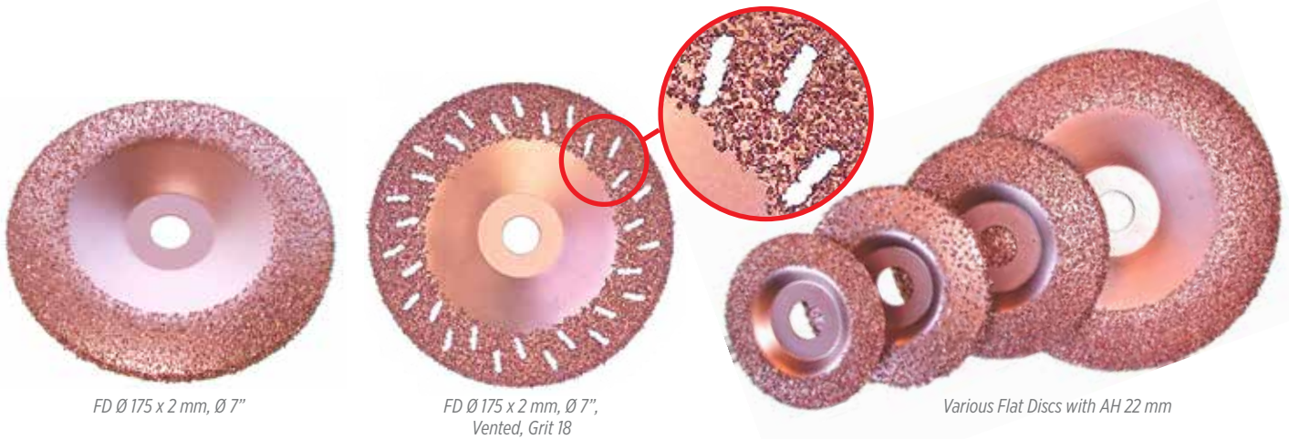
FD Ø 175 x 2 mm, Ø 7"