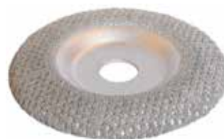
FDSP Ø 125 x 2.5 mm, AH 22 mm Ø 5"