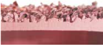
Copper Carbide Design