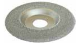
FD Ø 102 x 1.5 mm, AH 22 mm Ø 4"