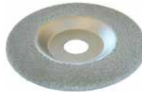
FD Ø 125 x 2 mm, AH 22 mm Ø 5"