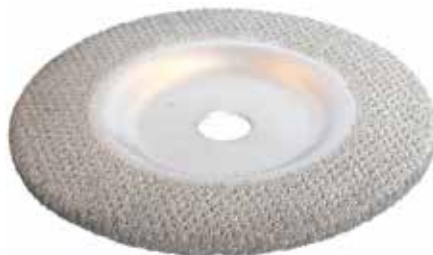
FDSP Ø 175 x 2.5 mm, AH 22 mm Ø 7"