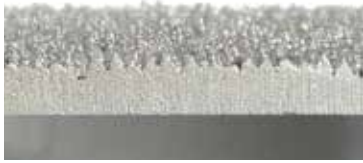
Steel Shot Grit Design