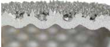
Super Patriot Design

OTR sidewall buffing | Large repairs | Conveyor belt repair | Conveyor belt preparation (removal of vulcanizing skin for the application of corrugated rubber cleats) | Pre cured tread preparation | Industrial rubber sheets buffing