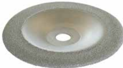
FD Ø 175 x 2 mm, AH 22 mm Ø 7"